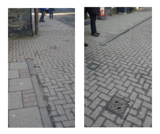
Confusing parking layout on Dunkeld St

On Dunkeld Street from the Spar to Pets Etc there is a stretch of pavement that at each corner, if walking in a straight line, turns into parking spaces. This is a confusing space and there is little demarcation between pavement and the road. This is a difficult space to navigate for pedestrians and especially the visually impaired.