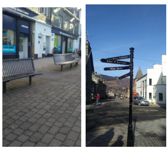
Seating and signs

The Market Square is due to be upgraded this year. This will include levelling the surface and removing parking spaces. It is currently a focal point with seating, litterbins and signage.