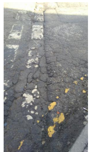
Carriageway at Moness Terrace