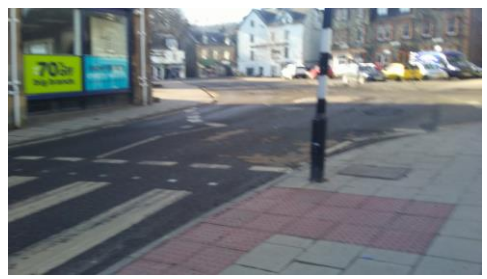
Zebra crossing at Birks Cinema

The Zebra crossing is in need of repainting and the lights on the poles could be brighter although it has tactile paving and dropped kerbs. Auditors said that they often preferred not to use this crossing point as it is very close to a mini roundabout and has poor sight lines. The other 2 approaches to the roundabout also have poor sight lines to the Zebra crossing and vehicles often travel at speed approaching the crossing, indicating drivers may not be aware of the facility.