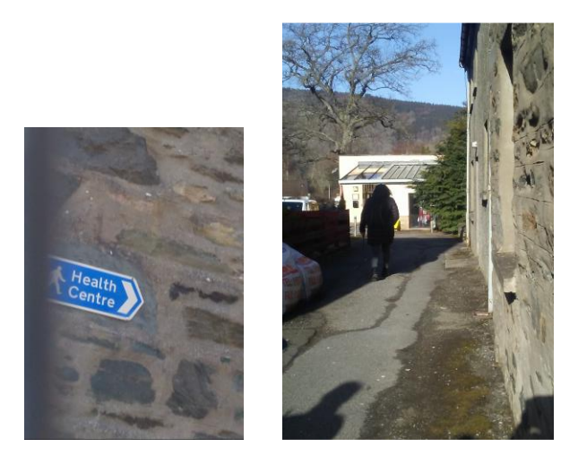
Path to GP and Care Home from Kenmore St

Path to GP Surgery and Care Home from Kenmore Street opposite the Police Station. This short path leading to the GP Surgery and Dalweem Care Home is a popular route from the town centre. The route via the main roads from Care Home and GP Surgery is much longer. The short path is badly maintained and in the evenings very dark. Staff reported that in the evenings they have to use a torch to navigate the path. The path is bordered by several homes and at times there are vehicles parked on the path, these can block the path so that wheelchairs cannot access.