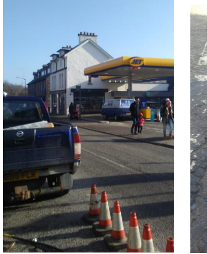
Dunkeld St at Jet entrance

One suggestion for improvement was to change the two parking spaces opposite the entrance to disabled spaces. This would hopefully have the effect of these spaces being empty for longer or less likely to have people double park beside them. This would only be effective if disabled parking was enforced.