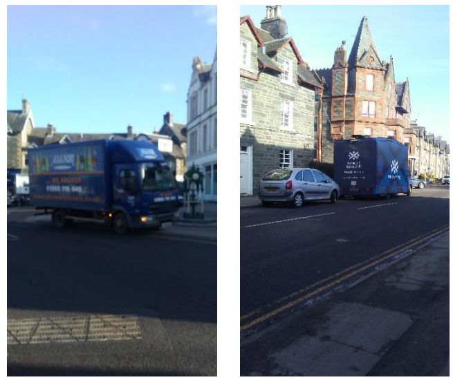
Double yellow line parking, Market Square and Dunkeld St

There are often vehicles parked on the double yellow lines on the Square, many of these are delivering goods to local businesses. Whilst on the audit it was also noted that the mobile bank was parked on Dunkeld Street close to the junction with Home Street.