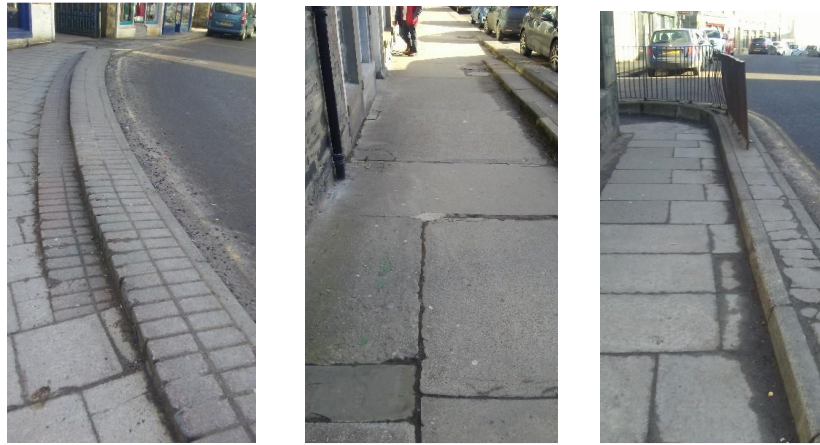
Split kerbs on Market Square and Bank St

• Split level raised kerbs on the Market Square and Bank Street. There is little contrast between the pavement and the raised kerb and this poses a potential trip hazard for the visually impaired, and this is increased if there are multi-level kerbs.