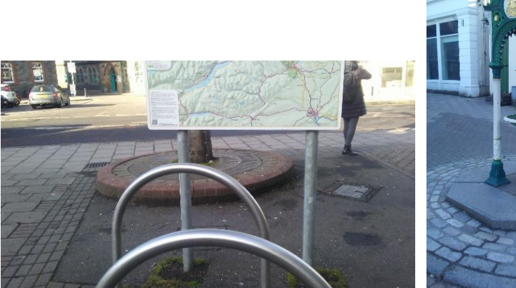
Information signs, bike stands and fountain