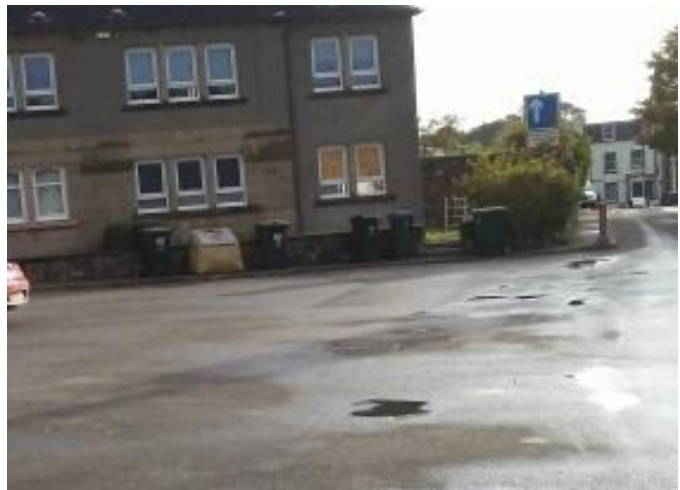
Bollard and Sandbox blocking footway on Bowton Rd