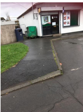
Lack of dropped kerb at Costcutter on Green Rd