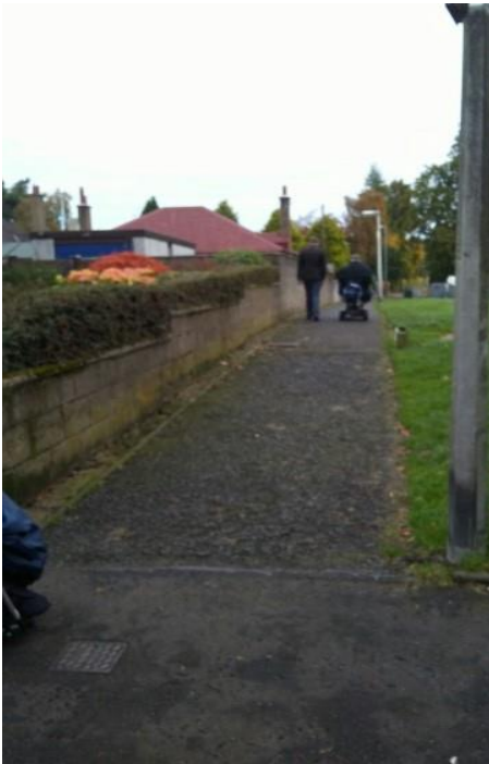
Path from Lomond Pl to Gallowhill Rd

The path from Lomond Place to Gallowhill Road is in very poor repair with a very uneven surface. As with the Greenpark path, repair and maintenance of this path would provide an accessible useful short cut for the less mobile. At the Gallowhill Road end of the path there is a metal barrier. The barrier is an obstruction to wheelchair, pushchair and mobility aid users. This barrier is due to be removed in the near future.