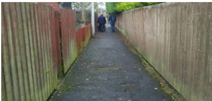
Greenpark path surface