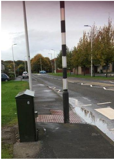
Zebra crossing on Springfield Rd

There is a zebra crossing on Springfield Road near the junction with Springfield Park. This is in fairly good condition, with tactile paving and dropped kerbs. The main issue with the crossing is the close proximity of the telecoms box to the crossing pole. This makes it difficult for people that use wheelchairs, mobility scooters, mobility aids or pushchairs to navigate past. The easiest solution would be to move either the telecoms box a few metres or to move the crossing pole and tactile paving to the crossing side furthest from the telecoms box. There is also evidence of pooling water at the kerb, indicating a drainage issue. This would be difficult for people with a visual impairment or many using mobility aids to avoid stepping in.