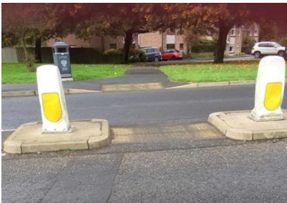
Crossing at Springfield Rd