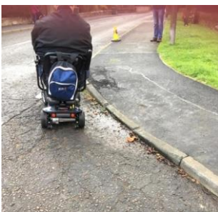
Poorly maintained dropped kerb on Station Rd