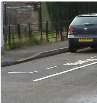
High dropped kerb on Montgomery Rd