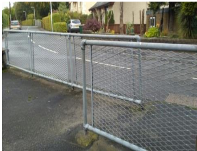
Barriers at Gallowhill Rd